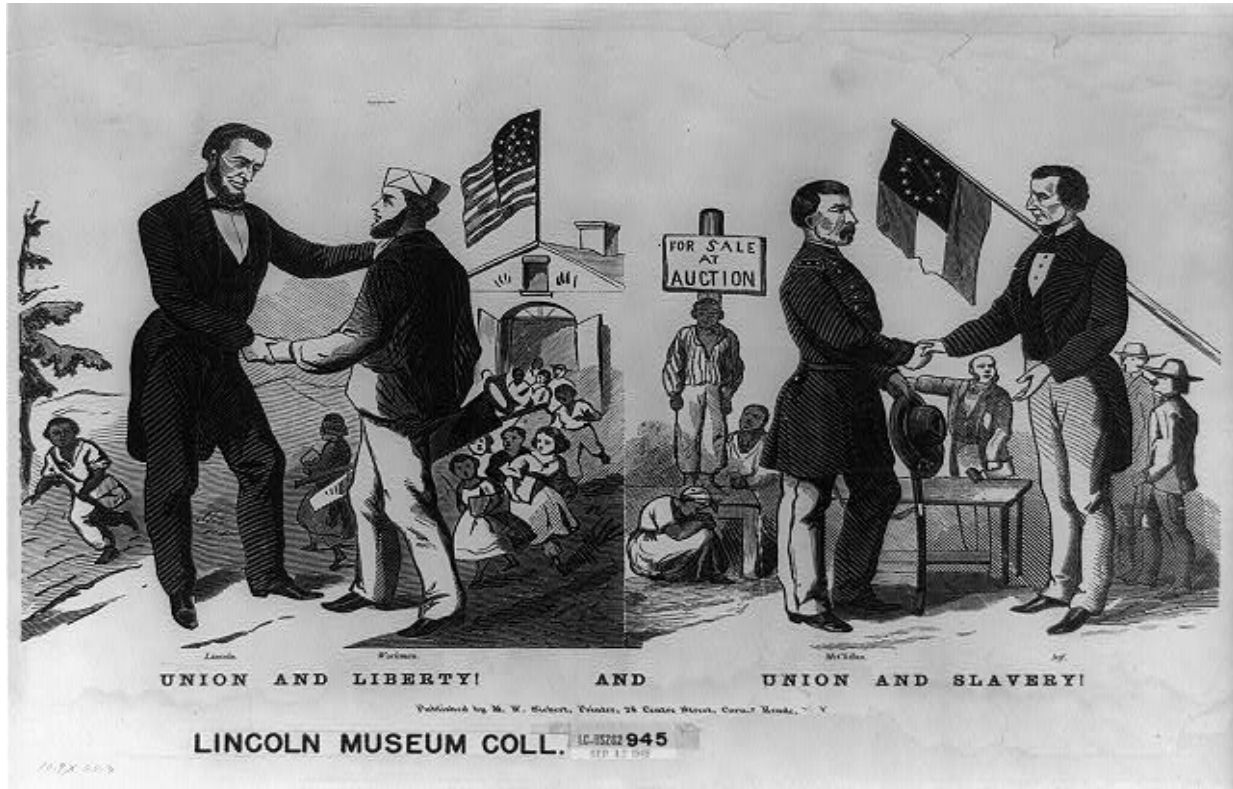
(Left: Abraham Lincoln; Right: George McClellan)